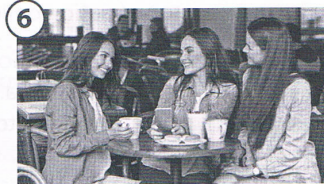
6 Sally often _____.