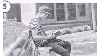
5 Al sometimes _____ and reads.