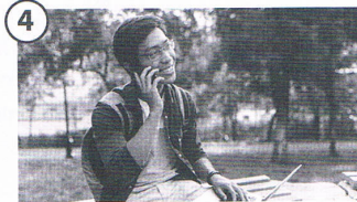
4 Ben _____ all the time.