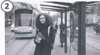
2 Eva has to _____.