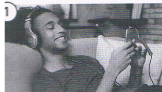
1 Josh _____ every day.

3 Look at the photos and complete the sentences with phrases in Ex 2. Use the correct form of the verbs.