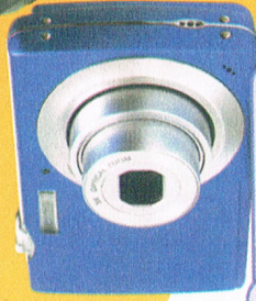
2 digital camera