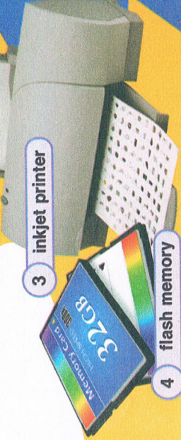
4 flash memory