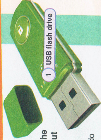
1 USB flash drive